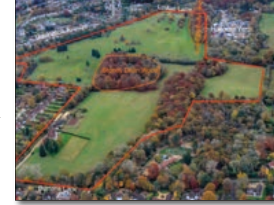
The green belt site proposed for the development, boundaries shown approximate

As Bucks Council has not found grounds to seek judicial review of the procedure used in the appeal, the next stage will be a planning application by the developer for approval by Bucks Council of