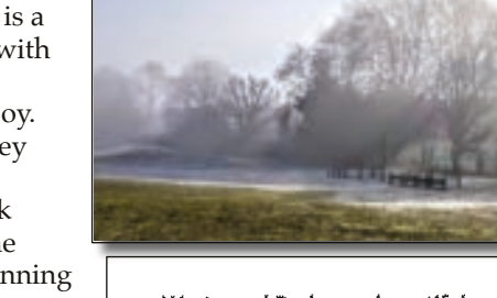
Westwood Park on a beautiful frosty spring morning

which was, sadly, a problem last summer. This should help to