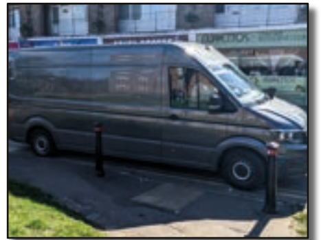
Blocking dropped kerbs could lead to a fine of £90

Here the total of drivers exceeding the speed limit is almost 60%, (with 1,395 driving at over 50mph),