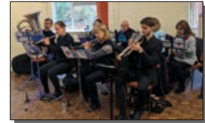
The Chesham Wind Band

Because the service was moved to the village hall this year, the wreaths could not be laid at the memorial stone to the