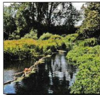
The beautiful River Chess, above, narrowing at Chenies.

The Chess is fed by springs that form where the water table reaches ground level. The subject of planning enforcement also arose,