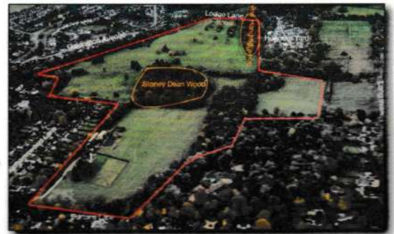
The green belt site proposed for development (boundaries shown approximate), and the ancient woodland affected therein

However, we have not asked for a full renewed campaign of objections. The approximately 1,100 objections